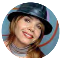
VICTORIA ABRIL FRANCE

OAfrica would like to thank our Goodwill Ambassadors from around the world who have dedicated incredible talent, time and finances to the children and families of our organization