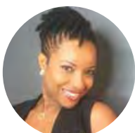
JOSELYN DUMAS GHANA