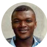
MARCEL DESAILLY INTERNATIONAL