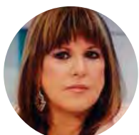
LOLES LEON SPAIN