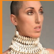
Rosy de Palma Spain