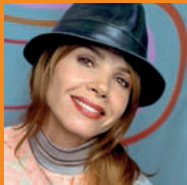
Victoria Abril France

OAfrica would like to thank our Goodwill Ambassadors from around the world who have dedicated incredible talent, time and nances to the children and families of our organization.