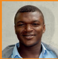
Marcel Desailly International