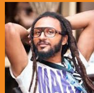
Wanlov The Kubolor Ghana