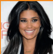
Rachel Roy USA