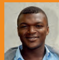
Marcel Desailly International