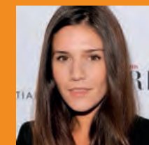
Margherita Missoni Italy