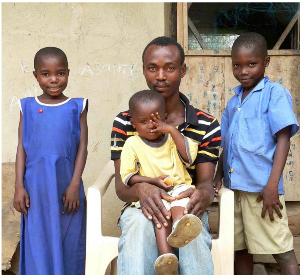
Reunified family, thanks to the OA Family Support Services Program

Children may be placed in orphanages after losing a parent, despite having family members who want to care for them but lack the means to do so. Orphanages often represent access to food, clothing, and education, when what really should be done, is make these necessities accessible in the local villages and communities. When an orphanage is treated as the principal solution, it can hinder the incentive for the local population to address the orphan problem and at the same time channel resources into making better orphanages, which encourages parents and families to abandon their children for lack of a better alternative. For all these reasons we channel our resources into supporting families and encouraging family and foster care as opposed to orphanage care for vulnerable children.