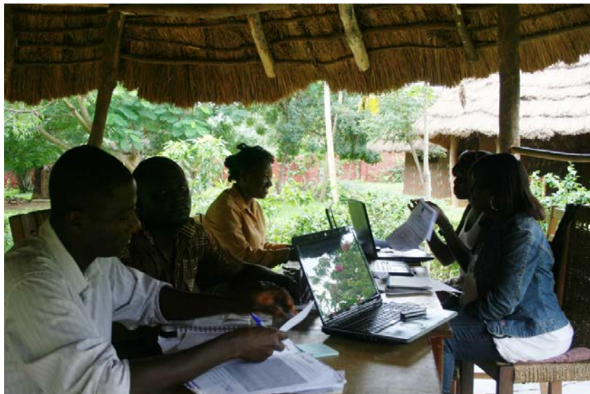
Family Support Services team meeting in Ayenyah

In 2011 we hope to achieve our major strategic objectives, including the measurable improvement of our Family Support Services Program. Our service delivery will be documented and show measurable improvement through impact indicators. Care Reform principles will be more widely advocated by OA to general public and stakeholders and applied by the Government of Ghana and Department of Social Welfare. We will maintain all our current projects and seek to improve and share our knowledge base, by partnering with other organizations. We will also continue to support the development of our immediate environment in the village of Ayenyah.